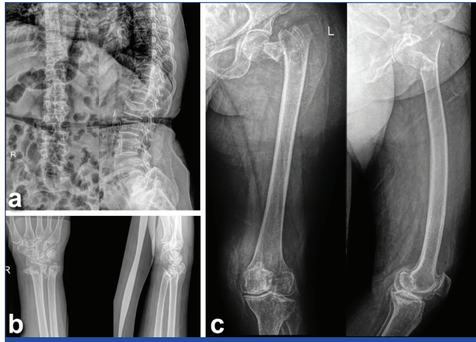
[Table/Fig-1]: a) Osteoporosis in the dorsal and lumbar spine X-ray showing generalised osteopenia, thinning of the cortex, striated appearance of the vertebral body, codfish vertebral bodies, multiple vertebral collapse with wedge shaped deformity; b) X-ray of wrist showing comminuted distal radius and ulna fracture in the osteoporotic bones. Periarticular osteopenia can be seen in the carpal bones of the hand; c) X-ray of femur with hip joint showing comminuted fracture around the hip in the patient with osteoporosis.

of diseases including hyperparathyroidism, hyperthyroidism, anorexia nervosa, malabsorption syndrome, chronic renal failure, and Cushing syndrome. Conditions leading to longterm immobilisation can also result in secondary osteoporosis. Long-standing secondary amenorrhoea due to non oestrogen hormonal therapy, low body weight, and excessive exercise leading to decreased bone mass can contribute to secondary osteoporosis. Men are reported to have secondary osteoporosis more often than women [Table/Fig-1] [7-9].